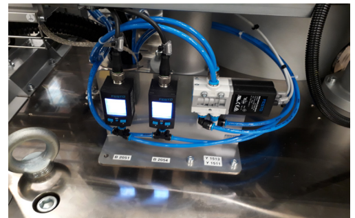
Infeed pressure sensor