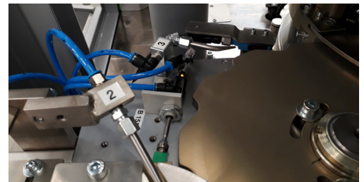
Cap stop monitoring

*Upgrades also applicable for SPM machines